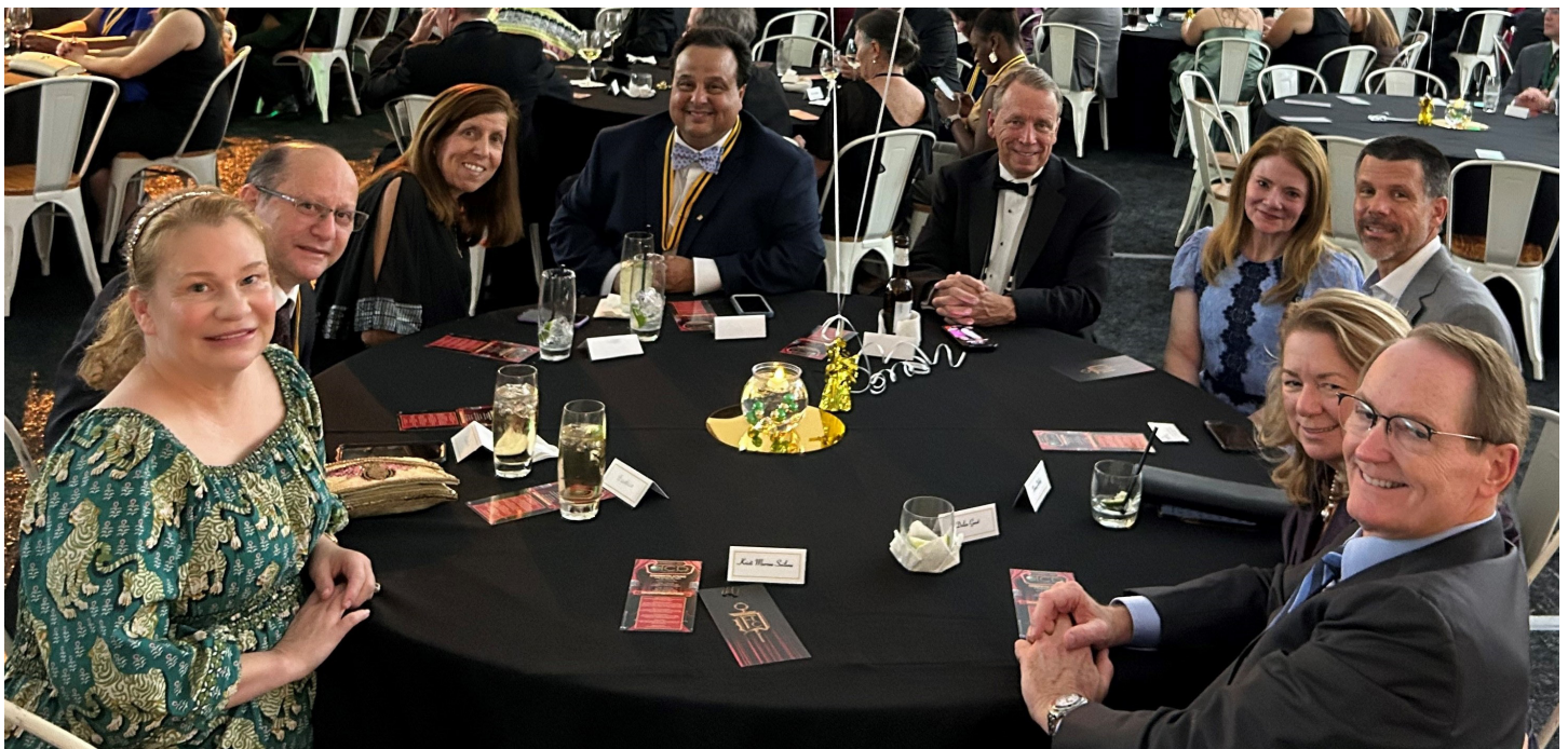
NODA members & guests enjoy the ICD 2023 Gala.