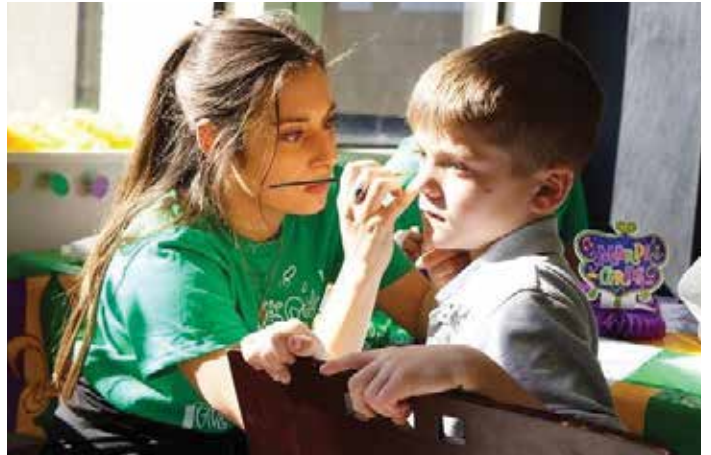
Student face painting for kids.