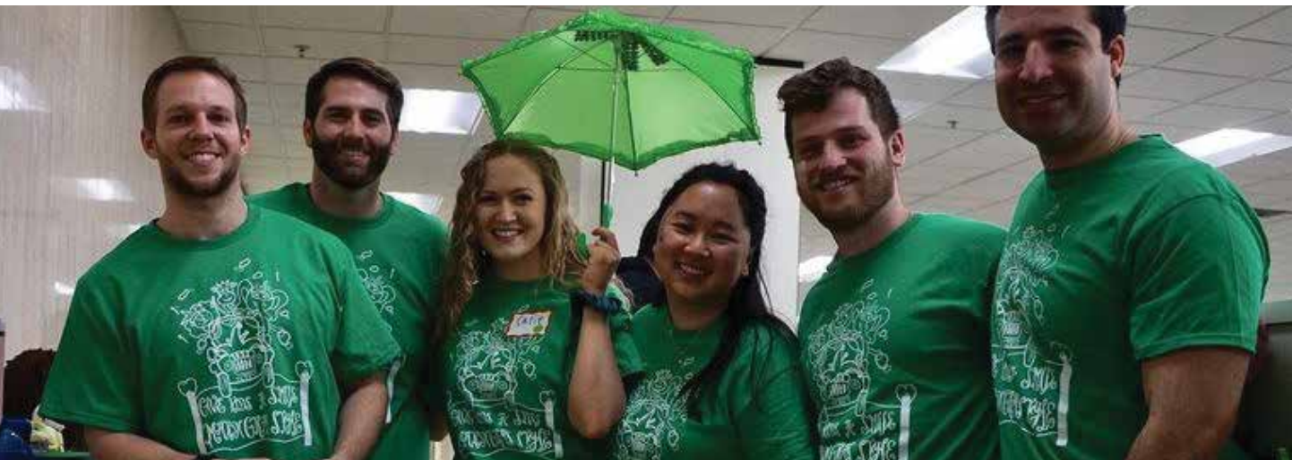
Team Green ushering in the kids for exam and cleaning!