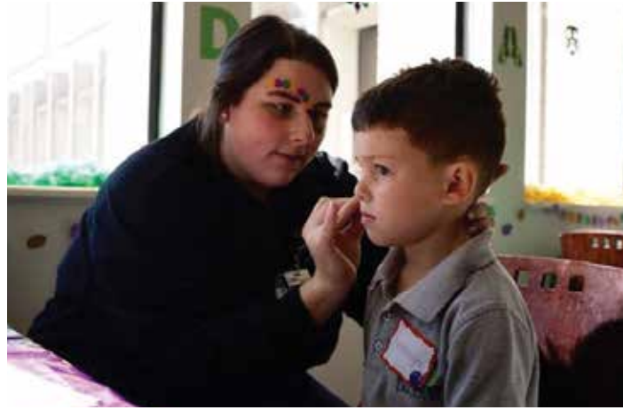
Student face painting for kids.