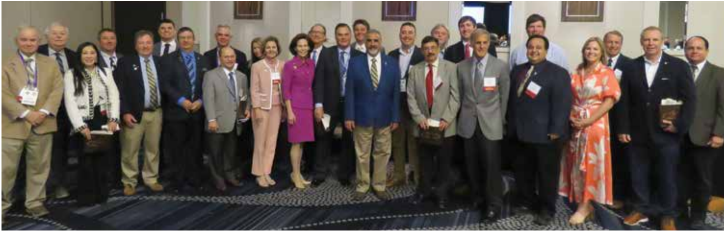
Delegates, Alternates Delegates, Directors to LDA, Staff.

Hyatt Regency New Orleans