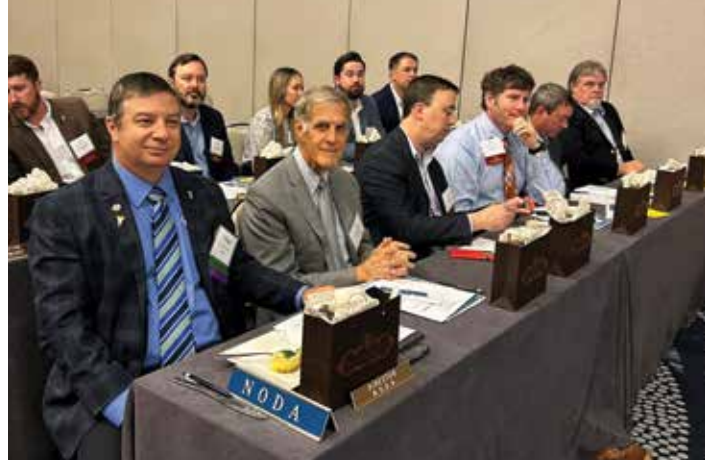
NODA Delegates, Alternate Delegates, Directors to LDA #1