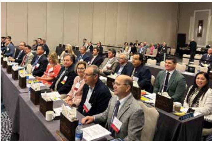
NODA Delegates, Alternate Delegates, Directors to LDA #2