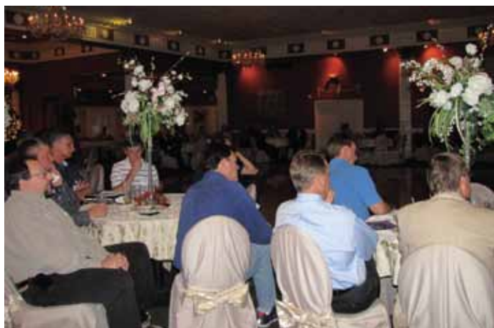
After a delicious meal, its time to relax and enjoy the lecture.