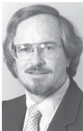
Answer on pg. 16